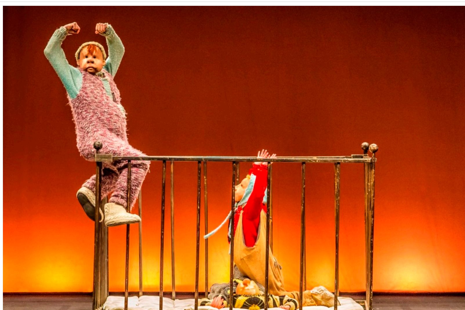
Familie Flöz in Infinita

Published: February 06, 2016 In: London (http://www.seeingdance.com/category/reviews/london-reviews/) , Reviews (http://www.seeingdance.com/category/reviews/)